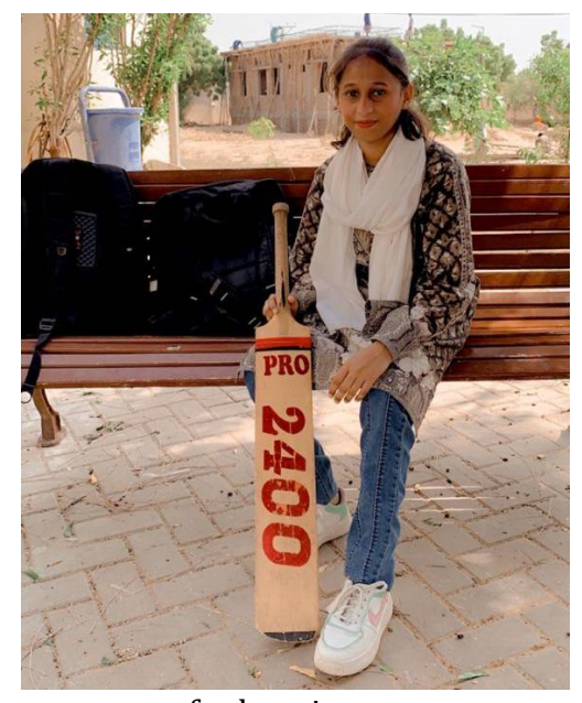
us a sense of relaxation.

serious concerns. But when I entered this city, I found that all my predictions were wrong. This is a city with hospitable and kind people, filled with natural beauty where animals are free. Even a few times, I witnessed peacocks at my hostel. Moreover, unlike other cities, this city is the cleanest among all with almost zero crime rate which gives