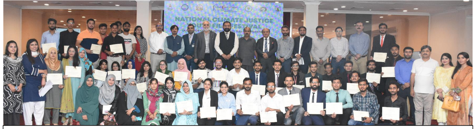
Group Photo of All Participants Who Participated at National Climate Justice Youth Film Festival at Avari Hotel Lahore, 24th August 2023

journey took them to Dadu, Sindh, where they shot footage in May 2023, and culminated in the public display of their work at the festival's finale in Lahore.