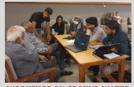
WORKSHOP ON GROUND WATER DISCHAGE POTENTIAL